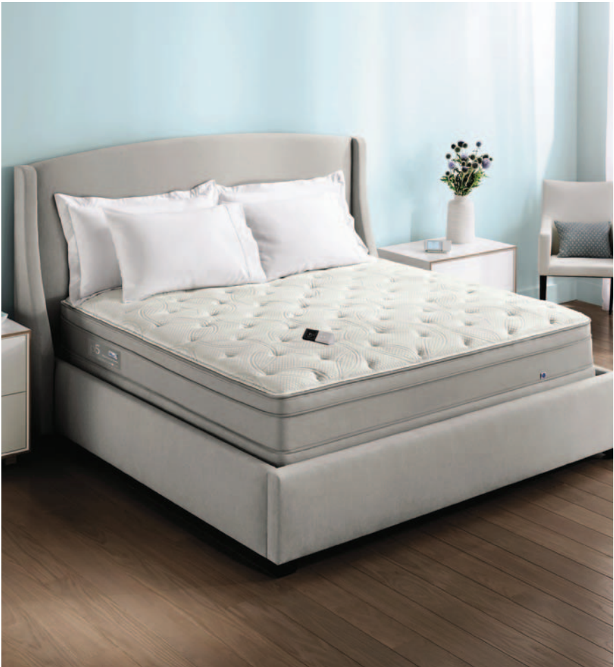
Mattresses now can suit different needs for couples, such as the wildly popular Sleep Number models.