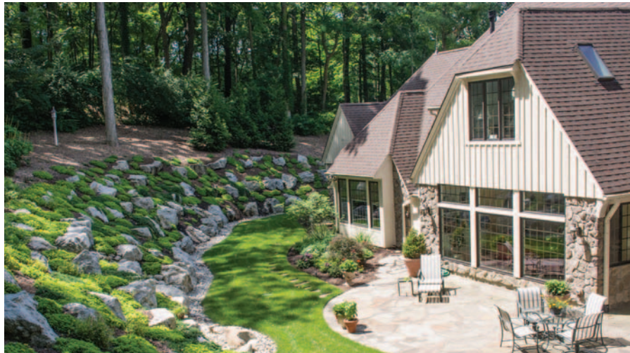
To help protect your plants from unpredictable weather patterns, it is best to properly apply mulch and place plants near your home or other greenery.