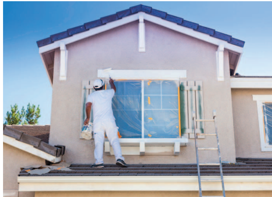
A new coat of paint and upgraded hardware on doors offers improved style that will, ultimately, attract buyers.

"Older garage doors can be a real eyesore," Miller says. "They typically