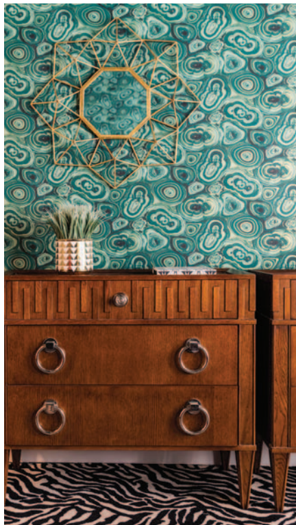
Mixing metals is a great way to add character and depth to a house. These oversized chrome drawer pulls contrast between the gold patina mirror and shiny gold geometric vase, which pop on the verde malachite wallpaper.

to accent your home with a more sophisticated look," Stern suggests.