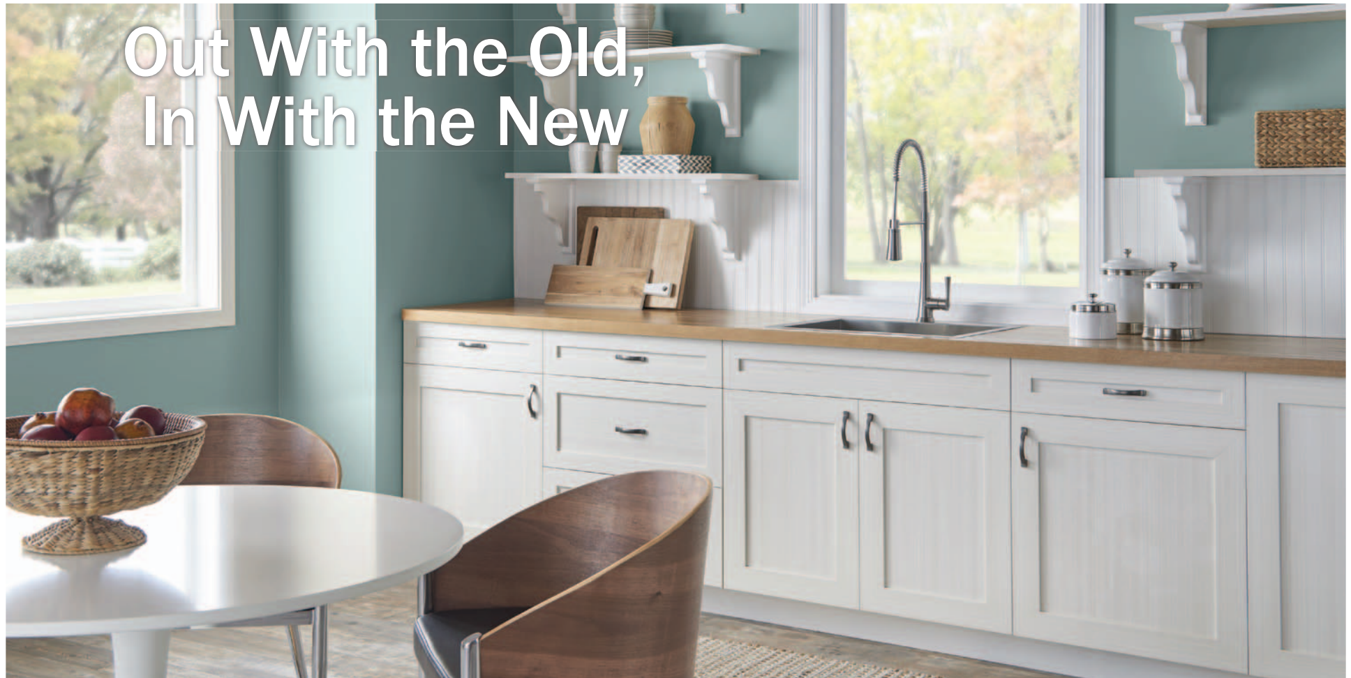
White walls are so 2017. This year, intense, vibrant colors are in, such as Behr's 2018 Color of the Year, In The Moment.