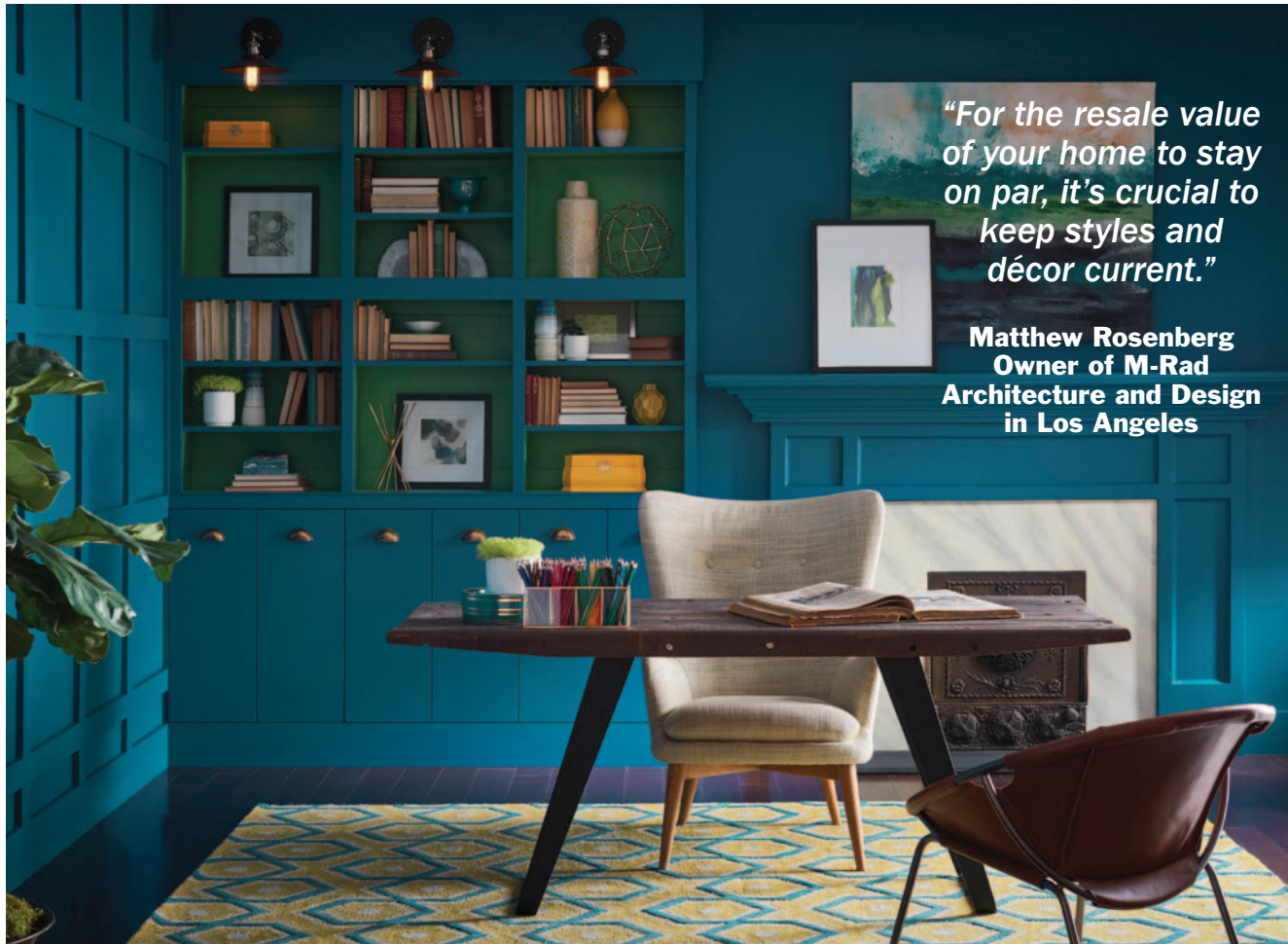
Sherwin-Williams Color of the Year, Oceanside, is a strong, bold palette that complements another 2018 trend – mixed materials.