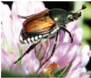
The Japanese Beetle benefits from warmer winters due to an increase in carbon dioxide in the soil.

“When plants become overgrown or too large for their location, a change is probably necessary,” Henriksen says.